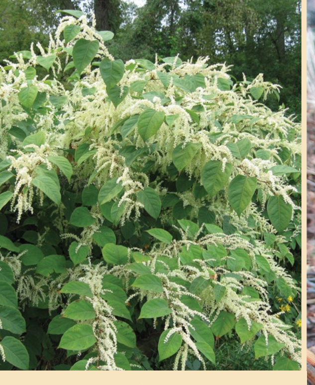
Japanese knotweed flowers