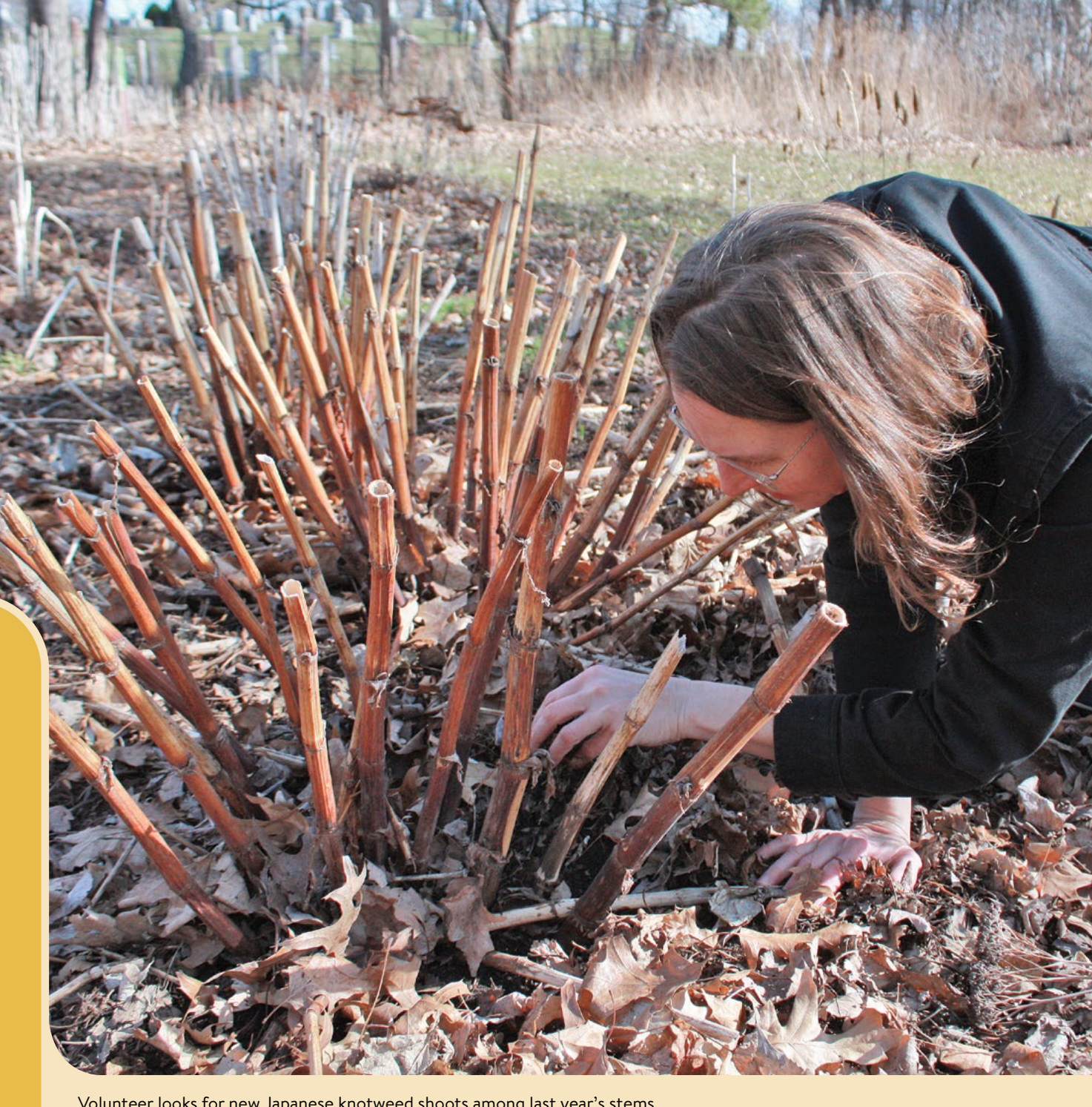
Volunteer looks for new Japanese knotweed shoots among last year's stems.