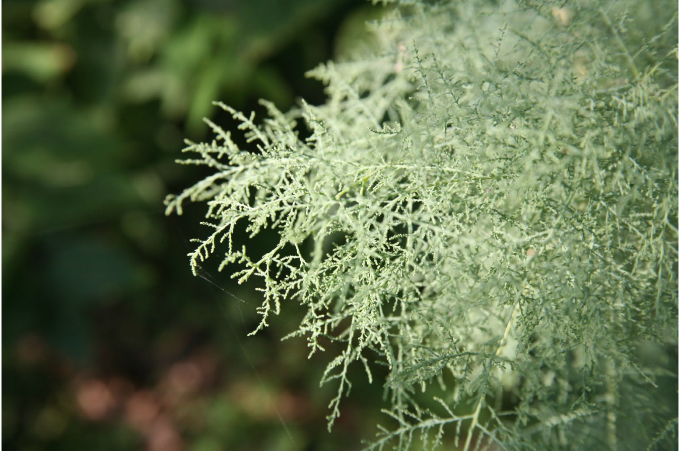
Photo caption: Saltcedar leaves are scale-like, similar to white cedar.