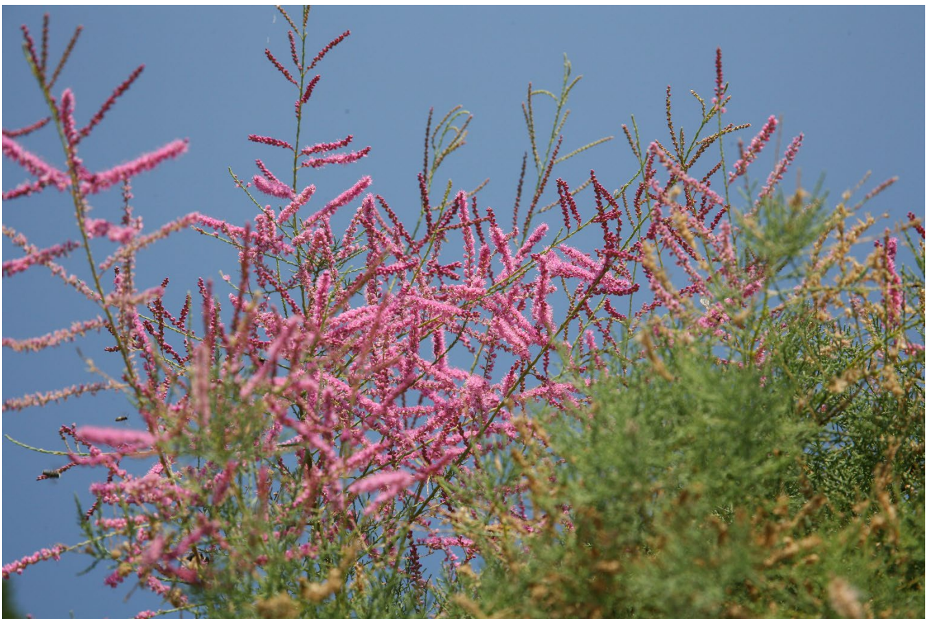
Photo caption: Saltcedar flowers are pink.