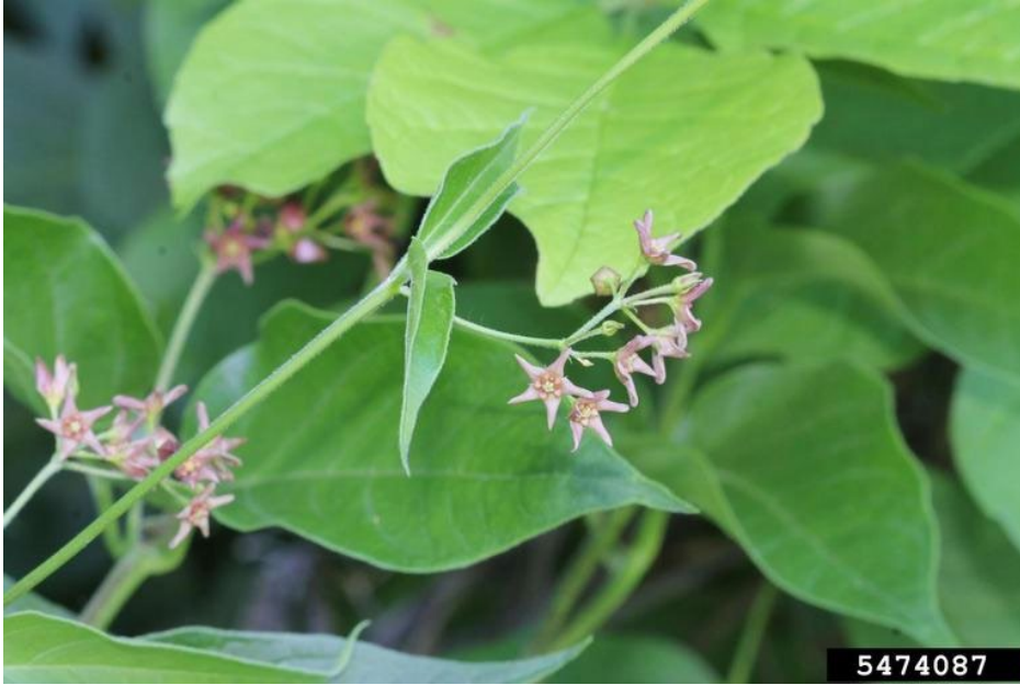
Photo caption: Pale swallow-wort flowers, Cootes Paradise, Royal Botanical Gardens, Dundas, Ontario, Canada.