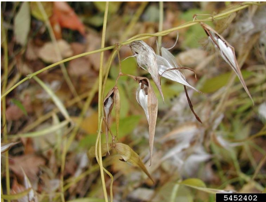
Photo caption: Pale swallow-wort seed pods and seeds.