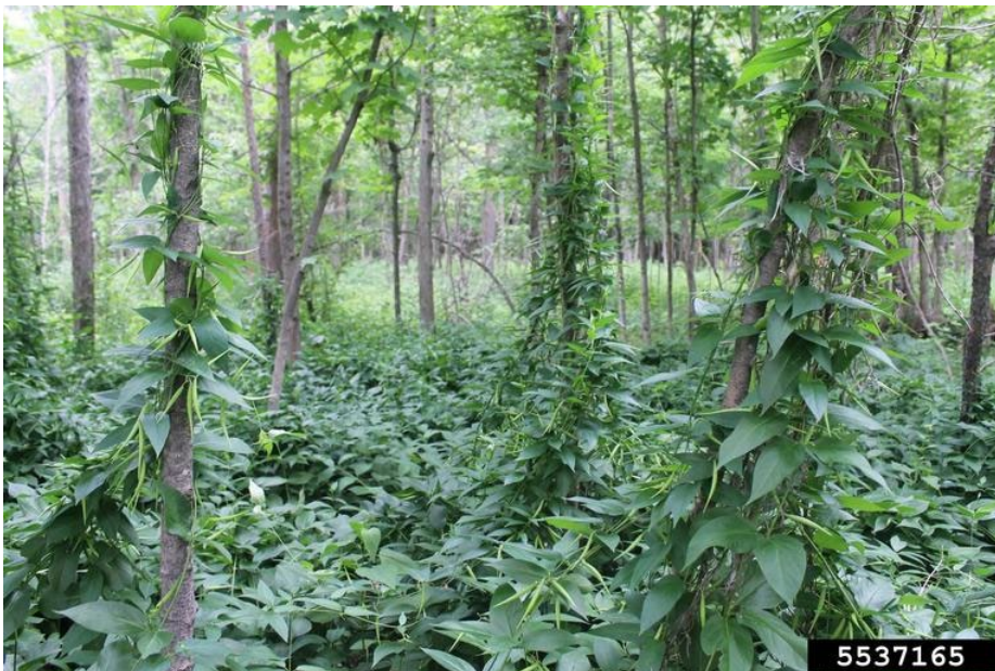
Photo caption: Pale swallow-wort, Ottawa, Ontario, Canada.